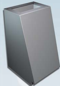
Medium Console Base

For more information contact your local Hamilton Distributor Subject to change without notice