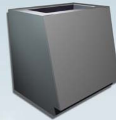
Large Console Base